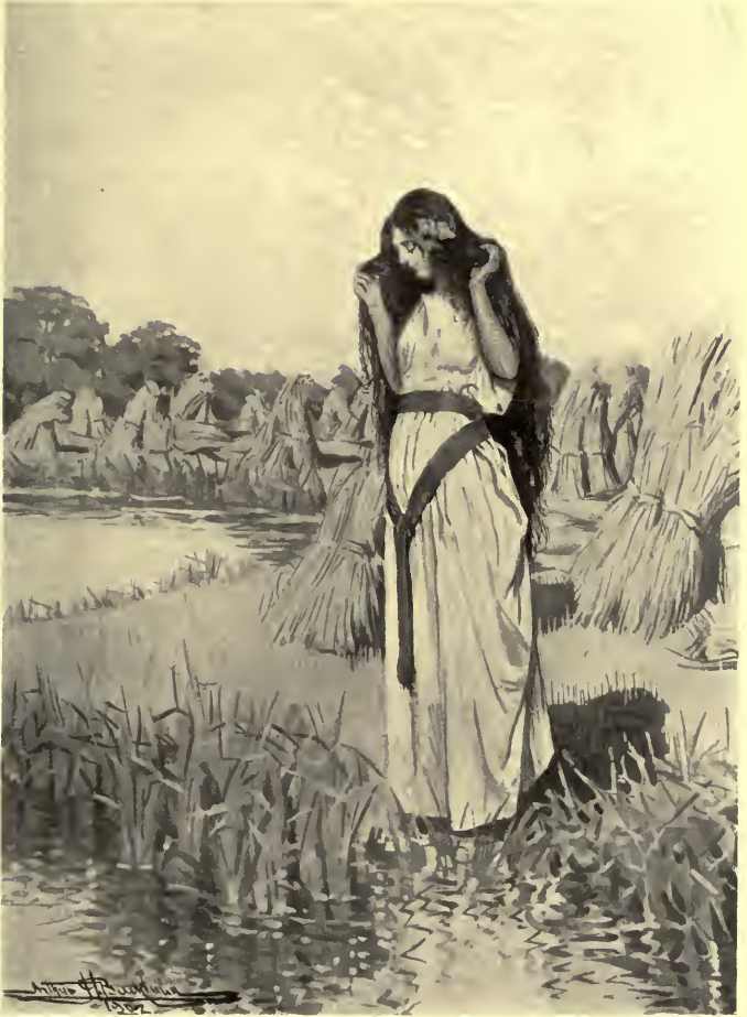
THE PICTURE WAS PASSING FAIR